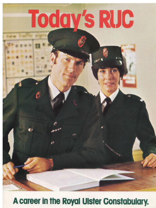
RUC recruiting literature circa 1974

The forthcoming volume of Irish Archives has as this year's theme justice and security archives across the island of Ireland. Volume 19 will mark