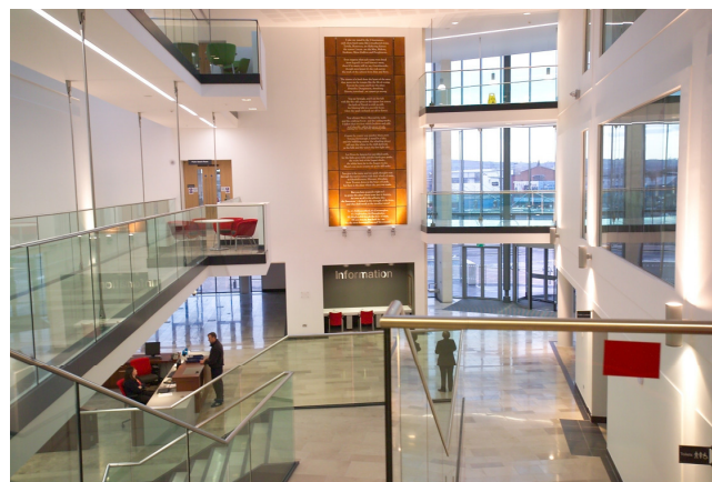
Public Record Office of Northern Ireland

amounting to just over 4,000 words, entitled 'Research Strengths at PRONI' - a introductory guide to illustrate the types of collections that might be suitable for further research. Indeed, this document is itself something of an understatement as the vast majority of our records are under-utilised and in spite of holding collections with national and international standing, spanning over 500 years of history for the north of Ireland, there is still something of a gap between how graduate research students approach PRONI and how we reach out to graduate research students.